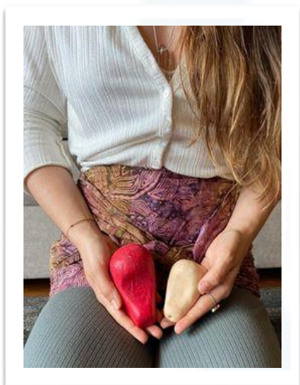
The uterus is the woman's center