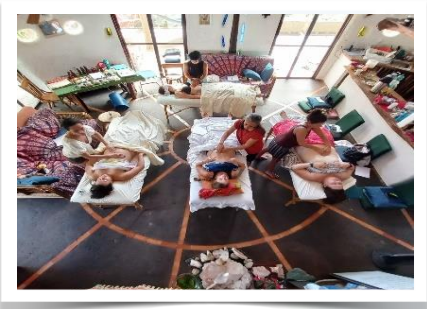
Class room at Arco Iris Farm