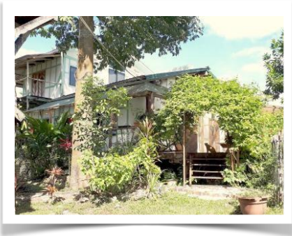
Arco Iris Permaculture Farm

The class is held at Eva Sengfelder's beautiful tropical home Arco Iris Permaculture Farm in Cayo District, Belize. This is home to Rainforest Remedies where you'll see how these herbal remedies are grown and produced.